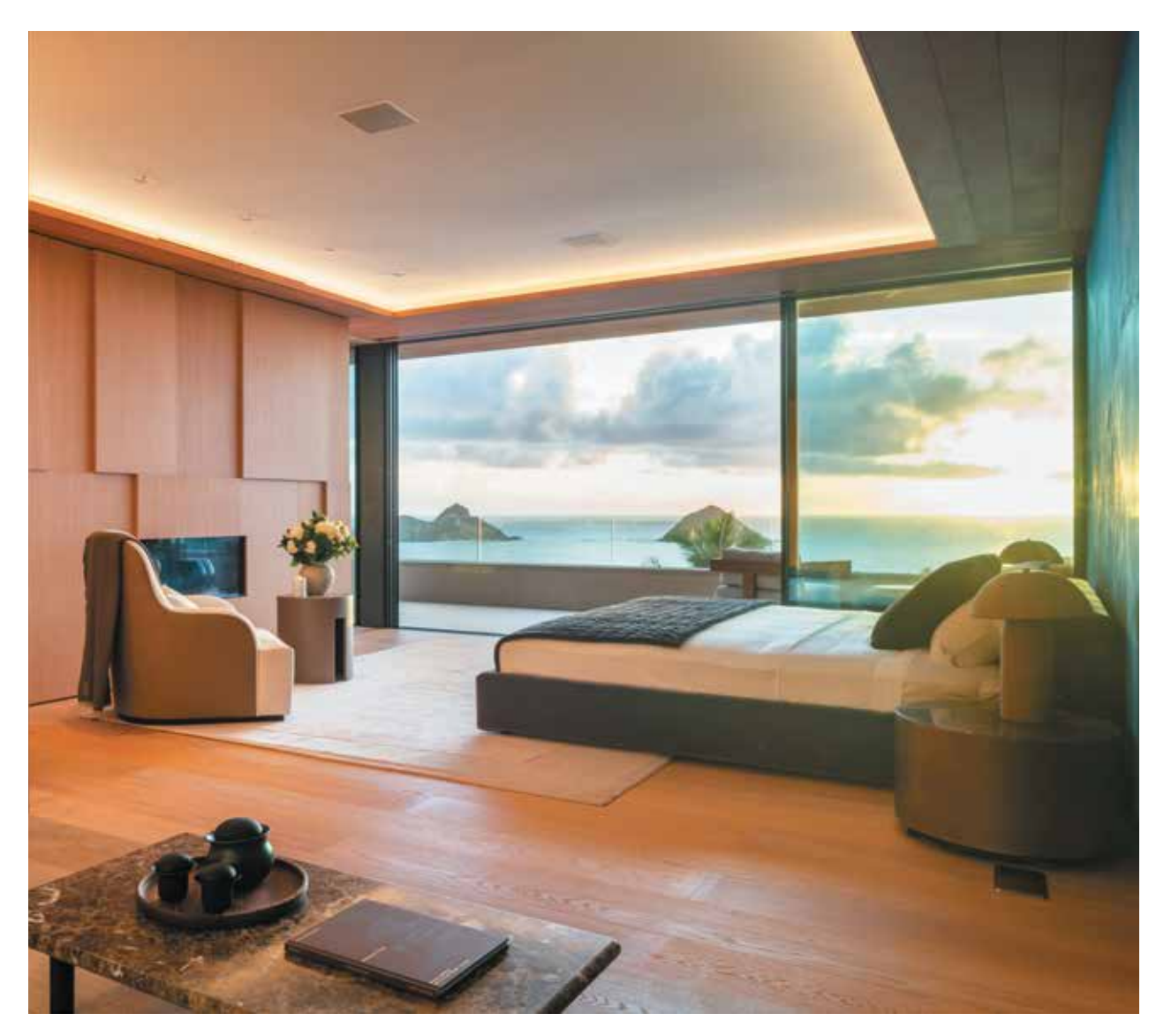
A bed, nightstands and an armchair by Meridiani sit on a rug by Mehraban in the primary bedroom. The French white oak used for the flooring and walls was sourced from Hakwood. The interior doors are from Lualdi.

for all of the home's wood floors, treated to withstand Hawaii's humid conditions. "We were not shy about anything," Giraldo says.