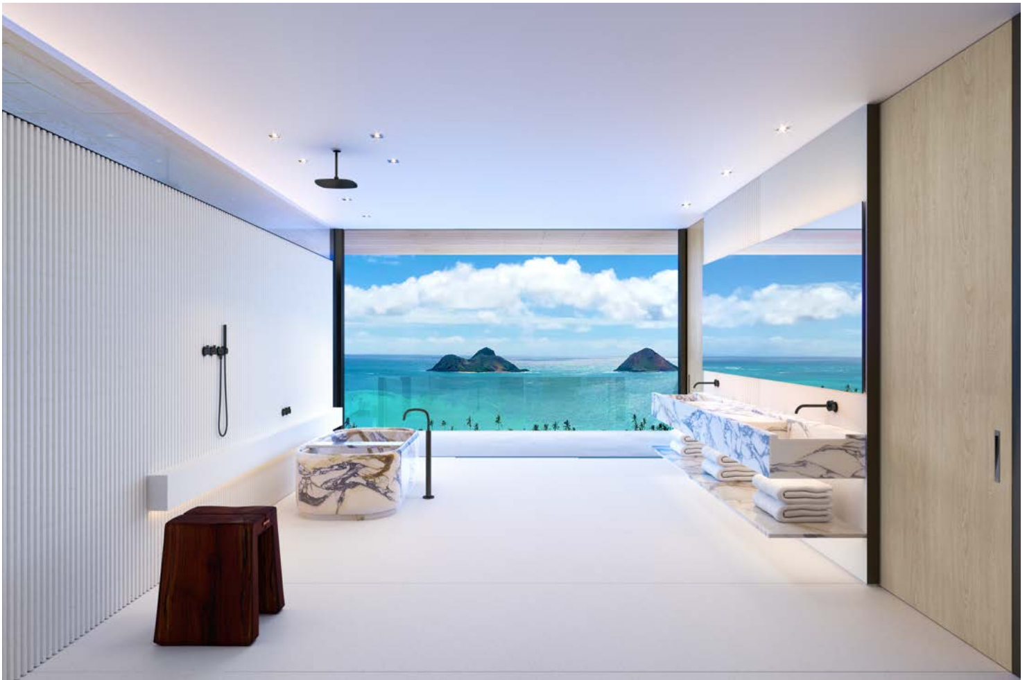
Rendering of the open-air bathroom using Sky-Frame windows and doors.

Passionate about nature, food and high design, the client desired a home infused with panoramic views, covered in the finest finishes, that features a show-stopping kitchen. Still in construction, the 6,500-square-foot home faces Lanikai Beach. "My client wanted to ensure that the eye could enjoy the spectacular views from every single space of the house while maintaining a great flow."