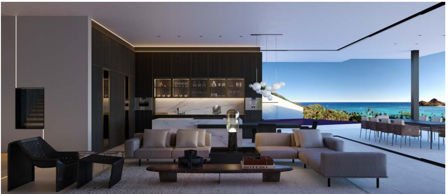
Rendering of the open-air kitchen and main living spaces.

Passionate about nature, food and high design, the client desired a home infused with panoramic views, covered in the finest finishes, that features a show-stopping kitchen. Still in construction, the 6,500-square-foot home faces Lanikai Beach. "My client wanted to ensure that the eye could enjoy the spectacular views from every single space of the house while maintaining a great flow."