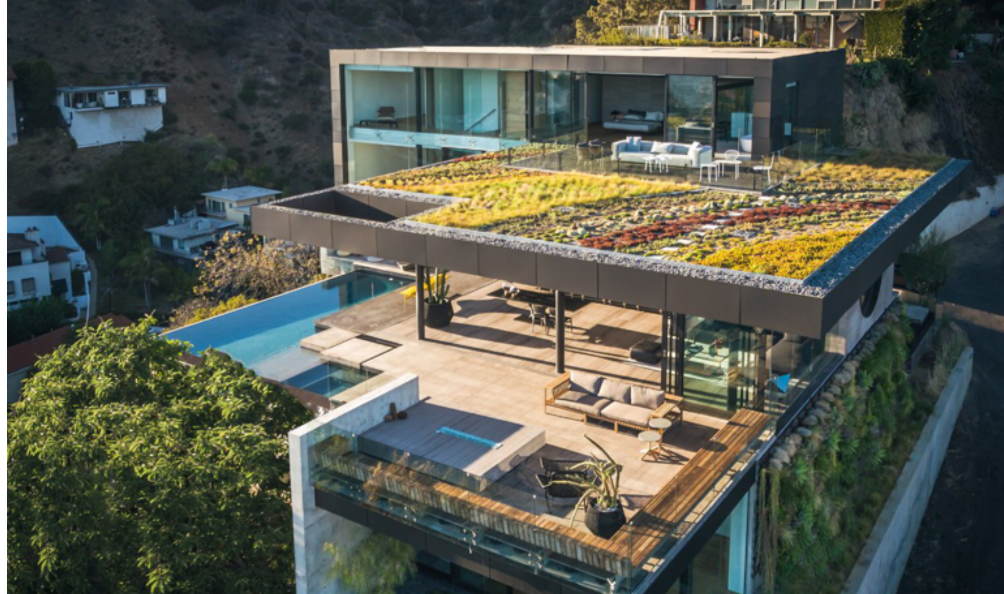
Franklin Residence, Los Angeles, USA, César Giraldo Design

I have a special affinity both for iconic pieces of the past and innovative contemporary designs. I love when the combination of the past and the present results in beautiful engagements. I believe that the beauty of the past must never be forgotten, as it not only informs the present, but also creates a marvelous balance with it.